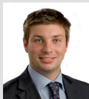
Cr Tim Smith Mayor City of Stonnington