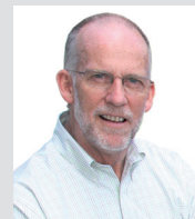
Cr Frank O'Connor Mayor City of Port Phillip