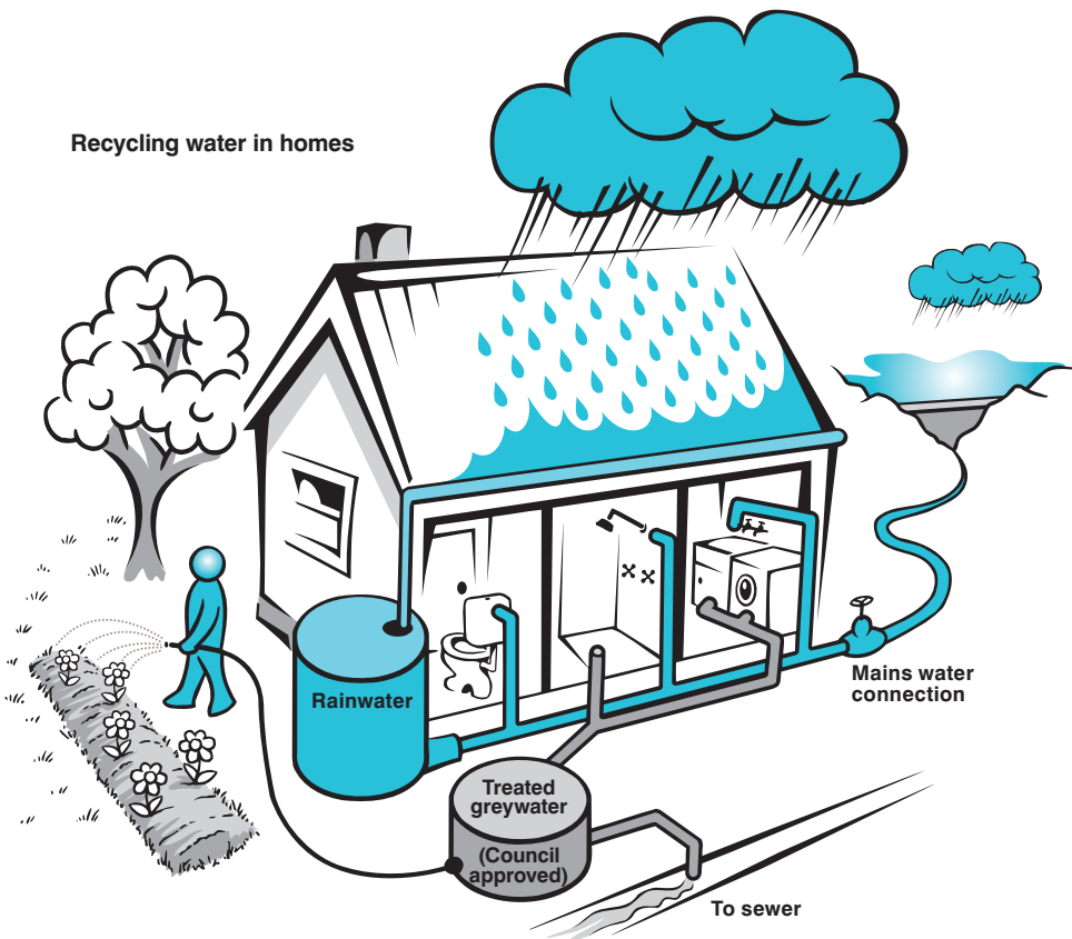
Recycling water in homes

Prior to planning a greywater treatment system, you need to obtain advice from a licensed plumber, the Department of Health and the Environment Protection Authority. A permit from Council is required.