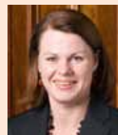
Cr Rachel Powning Mayor City of Port Phillip