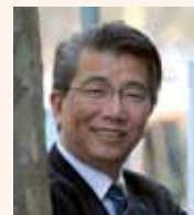
Cr Rachel Powning Mayor City of Port Phillip