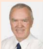
Cr Geoff Barbour Mayor City of Yarra

We take this opportunity to recognize the commitment of over 50 council officers and representatives from partnering organizations who continue to work collaboratively to deliver these outcomes.