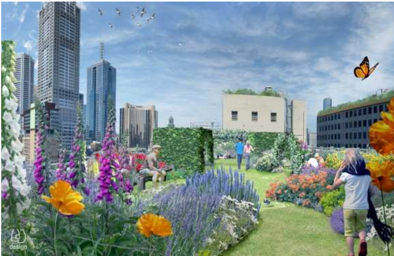
Photoshop image from Do It On The Roof , a campaign for (public) green roofs in Melbourne

From an InDesignLive article by Annie Reid: