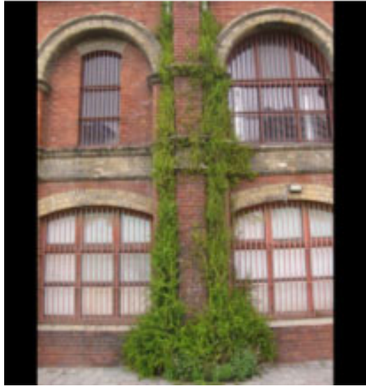
A green façade in the Melbourne CBD.

The project is funded through the Victorian Government's Sustainability Fund under the Victorian Local Sustainability Award.