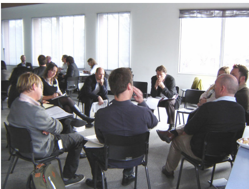
Growing Green Guide first stakeholder workshop