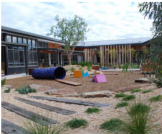
A childcare centre green roof in the Docklands.

"I am very much looking forward to this. It's good for residential, good for design and good for the environment," he said.