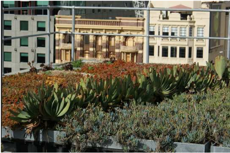
Succulent plants on top of the City of Melbourne's East Core green roof

The Growing Green Guide for Melbourne (GGGM), a partnership project between the Melbourne School of Land and Environment (MSLE) and Inner Melbourne Action Plan (IMAP) councils, has been launched.