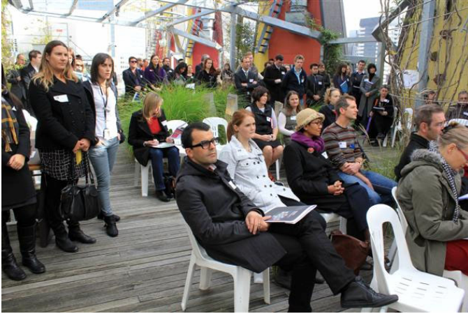
Growing Green Guide project launch