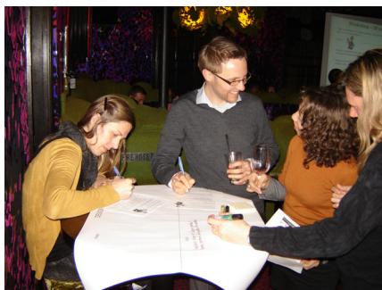
Growing Green Guide second stakeholder workshop