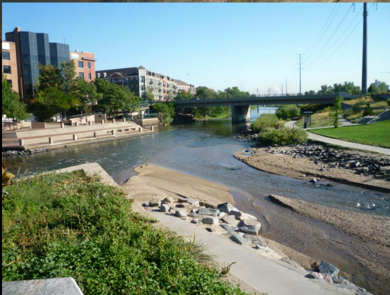
Flood Management Works