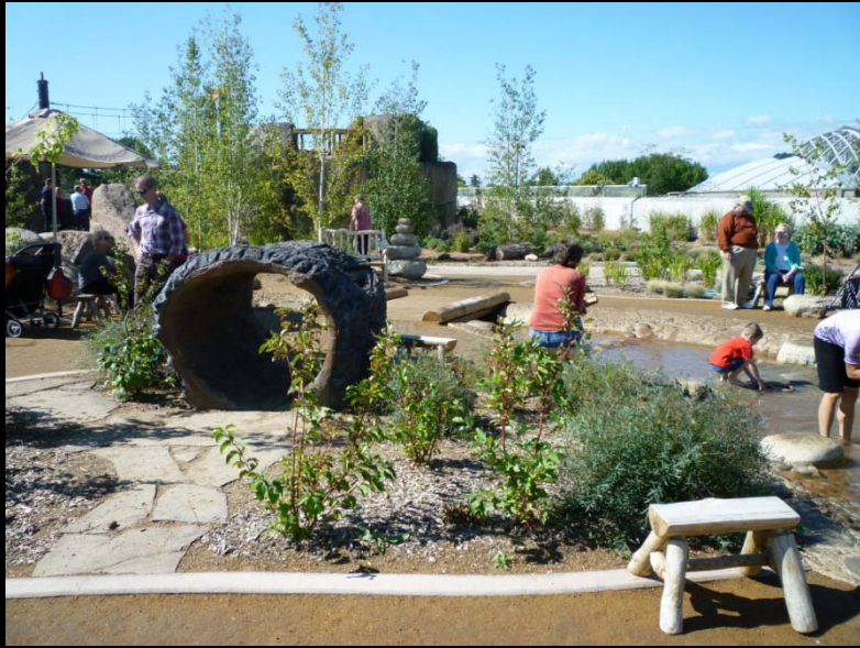
Denver Botanic Gardens