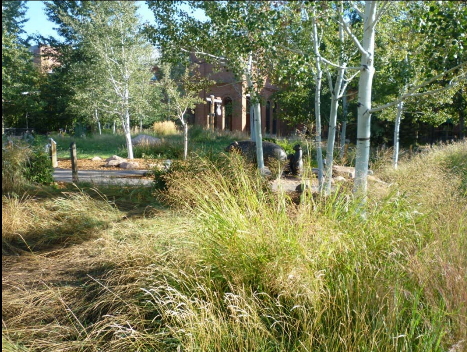
Extensive Green Roof – Commercial Development Denver