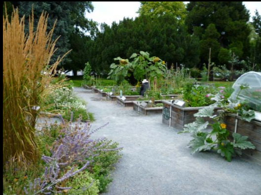
City of Vancouver Town Hall