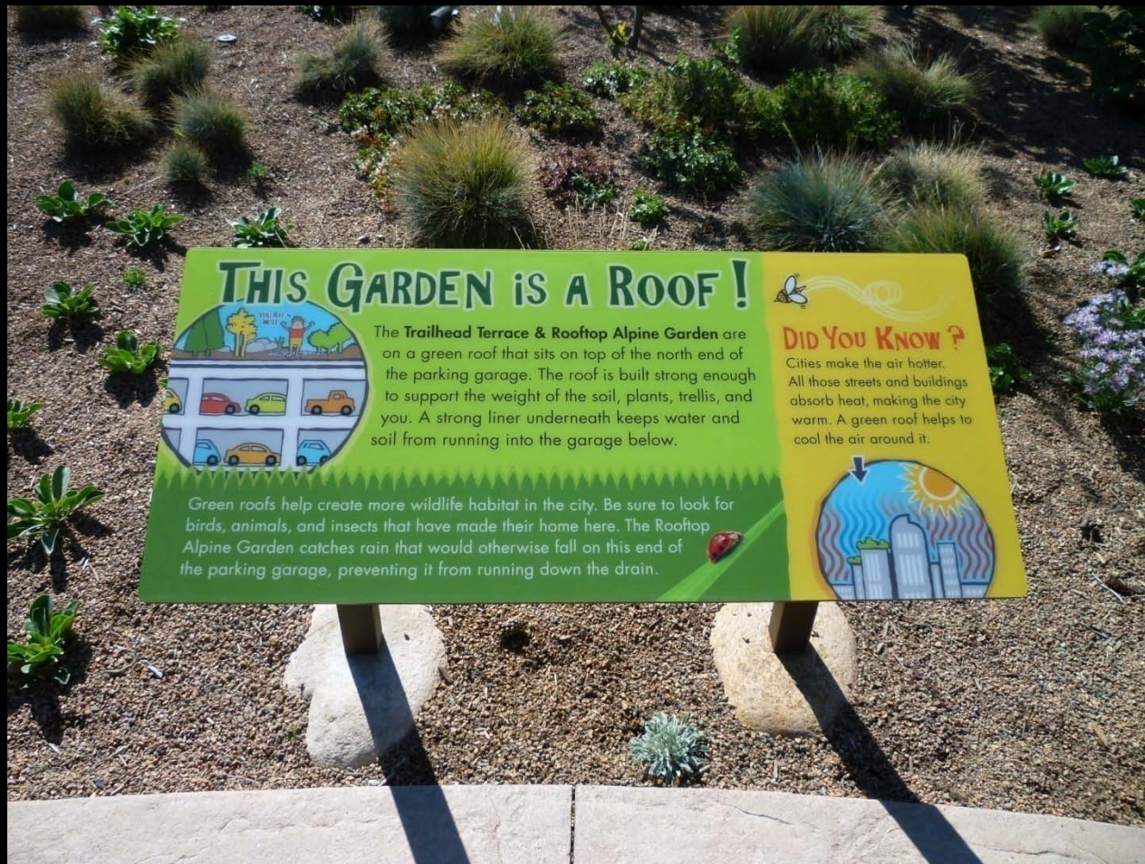
Rain Garden – on top Botanic Gardens Car Park