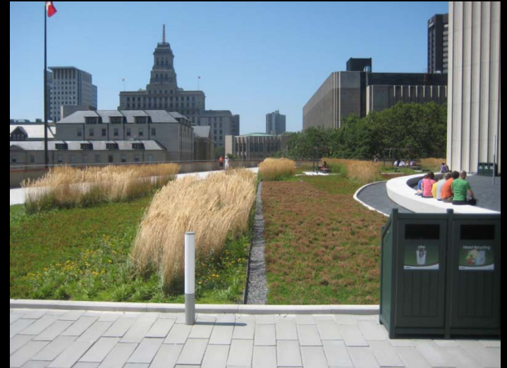
Comparison to intensive Green Roof Toronto