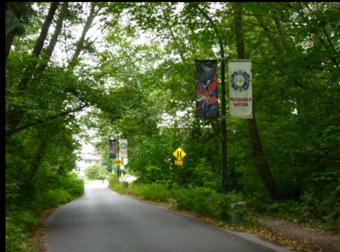
Water Sensitive Urban Design Streets and swales