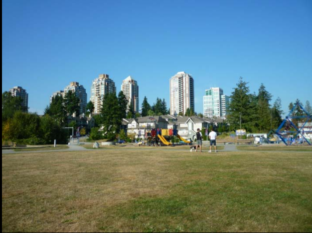
Reclaimed land fill